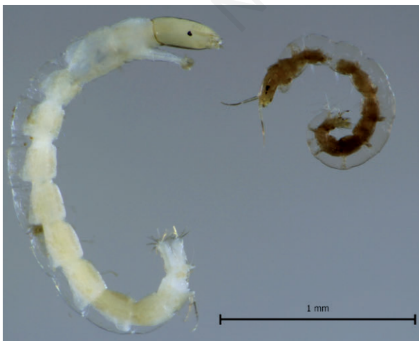
Fig. 1. An example of Monopelopia tenuicalcar (left) and Corynoneura sp. (right) larvae used in the experiment.

As the mortality of Corynoneura sp. larvae in the