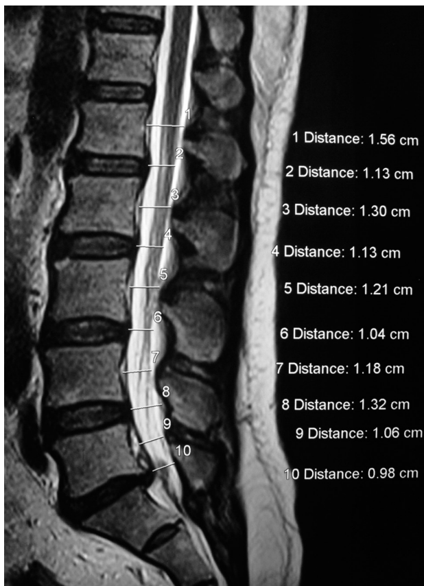
Fig. 3. Sagittal view of L-S spine showing absolute stenosis at L5-S1 measuring 0.98 mm.

mm 2 was considered as moderately stenotic; and greater than 100 mm 2 as normal [10]. Analysis of the data was done to compare the radiological findings as recorded by the magnetic resonance imaging and the percentage disability recorded by the Oswestry Disability index. All patients were also divided into two groups, based on thecal sac CSA of 70 mm 2 . The disability scores of the two groups were analyzed statistically to determine the critical threshold of lumbar canal stenosis.