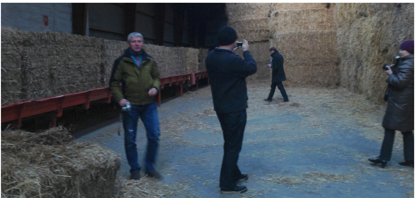
Renewable energy tourists.

group going, and we ended up with a plant fuelled by woodchips from the local forest and solar collectors [a necessity because of the many tourists wanting to heat their houses during summer], the only one of its kind as far as I know. That kind of group never existed in Besser [another village], so they never got a district heating plant" (interview, Nov 2013). The realisation of the different parts of the REI project thus depended on the willingness of the inhabitants of the relevant areas to take the initiative and put in the work. According to the chairwoman of the Nordby working group, the group consisted of ten people "representing all relevant interests": there was a representative of the village church, one from the school, a blacksmith and one of the area's big farmers, as