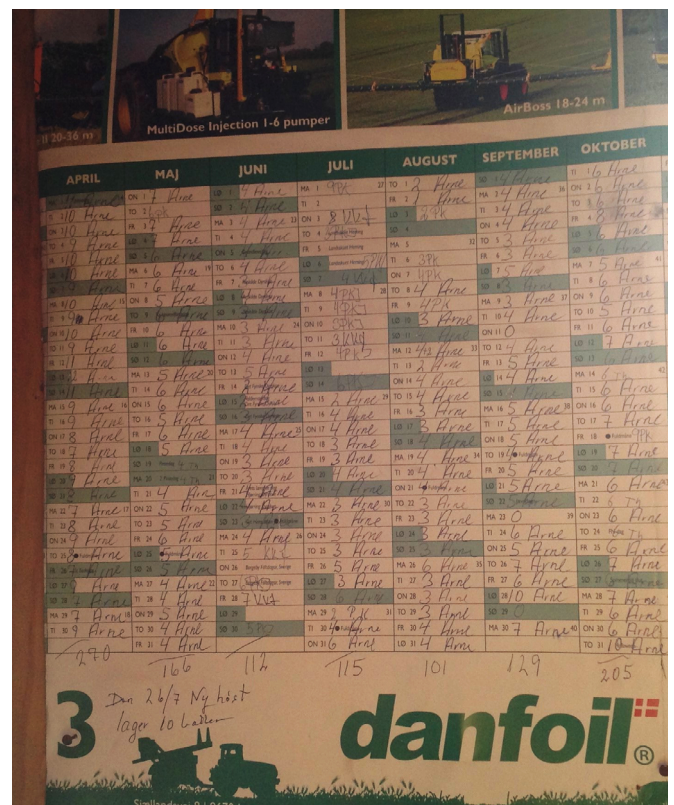
Arne's maintenance schedule.

A notion akin to but more fitting than the boundary object and closely related to energy is that which Gabrys calls 'the diverging materialities of energy' (2014): acting through energy allows for translations between various registers. Energy transitions can be framed in economic terms, as being about securing a sustainable flow of income and jobs. They can be about the environment and/or about how climate change demands that we shift our energy sources, habits and modes of production. They can be linked to moral, social and political issues. These diverse registers do not exclude one another but co-exist and impinge on each other, and the resulting muddying of the picture of what 'participation' looks like in practice is exactly what makes this type of participation material. Moreover, this removes us further from the boundary object the different meanings of which might intersect but are