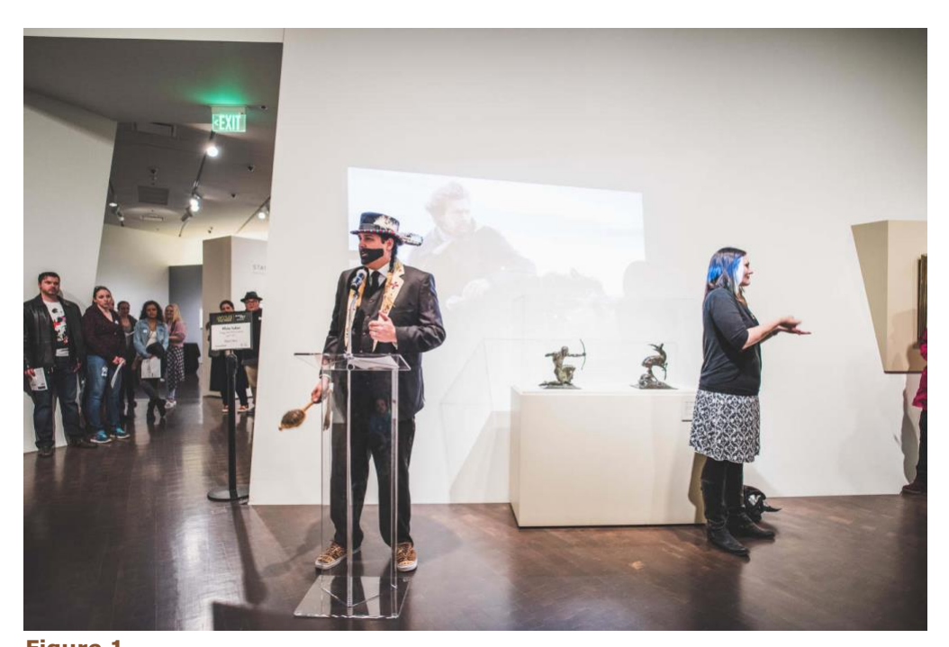
Figure 1 Gregg Deal, White Indian . January 29, 2016. Denver Museum of Art, Denver, CO. Photos by Kelsey Huffer. Courtesy of Gregg Deal.

creating space for truth telling. Deal's work is explicitly decolonial in the way that it grapples with historical traumas and pushes past acts of survivance. His performance of White Indian is a vehicle for the truth-telling that Lonetree calls for in Decolonizing Museums .