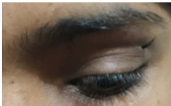
Fig 2. Ectopic cilia on left upper eyelid on down gaze

Histologic examination of the specimens demonstrated the presence of apocrine and pilosebaceous glands.[5] Ectopic cilia adherent to the underlying tarsus during surgical excision have been reported.[6]