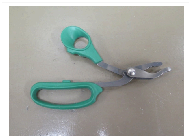
FIGURE 1 | Koechner device. Single angle (top) blade to be placed above the top of the neck at the base of the skull. Double angle (bottom) blade to be placed under the back end of the bird's jaw.

The onset and duration of involuntary movements (neuromuscular spasms) were recorded. Time to last movement was recorded using end time of clonic and tonic convulsions, whichever occurred last. The presence and duration of the heartbeat were monitored through palpation and indirect auscultation. Cardiac arrest was estimated when no heartbeat could be palpated or auscultated with a stethoscope. Time of death was estimated when all reflexes had ceased entirely and