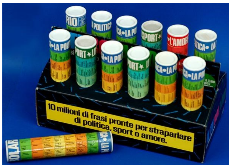
Figure 7. Tubolario (1983).

Out of production for years and almost completely forgotten, “Tubolario” has been recently rediscovered thanks to an interactive online remake. 23 In some forums 24 dedicated to “Tubolario” several users remember that “era semplicemente un gioco per ridere un pò e prendere in giro [...] certi discorsi roboanti che però nessuno capiva.” 25 The same ludic approach, as already said, features Italian automatic generators present on the web, in most cases designed with political and social satirical intent, a percentage that is well expressed by the collection realized from 2008 to 2012 on the metilparaben blog. 26 Among the 101 generators collected, 85 are related to political satire, 11 to social satire, 3 to religious satire, and one of them parodies the jargon of marketing. In particular, it is possible to note that the generators of political and social satire 27 seem to be characterized by contingency: namely they are concentrated on specific issues related to news or social events and designed in conjunction with such events. Another interesting example could be represented by the website aVanvera , 28 updated to November 2004, as it presents some of the main features of Italian