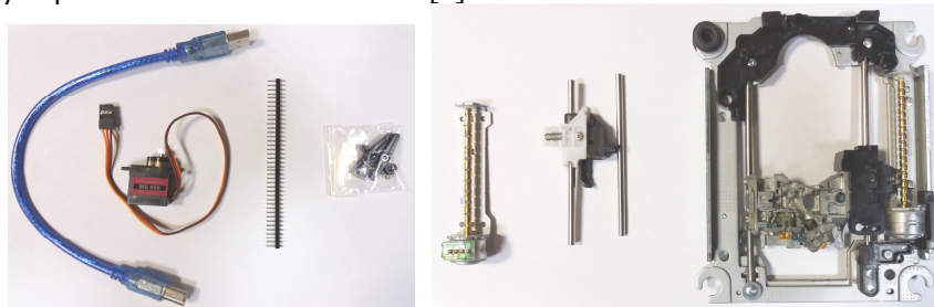
Figure 1. Mechanical parts and wire connections

The drive electronic circuits receive PWM (Pulse Width Modulation) signals from Arduino ports to control the speed and direction of motors. The stepper motors are considered the heart of mini-plotter, figure 1, because the printing accuracy depends on them characteristics [7].