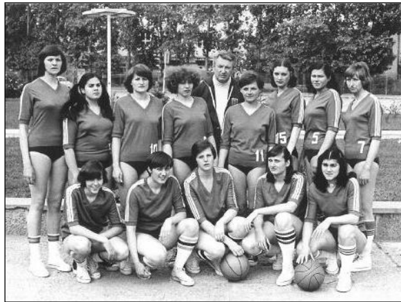
Figure 1. Crișul Sports Team, national champion