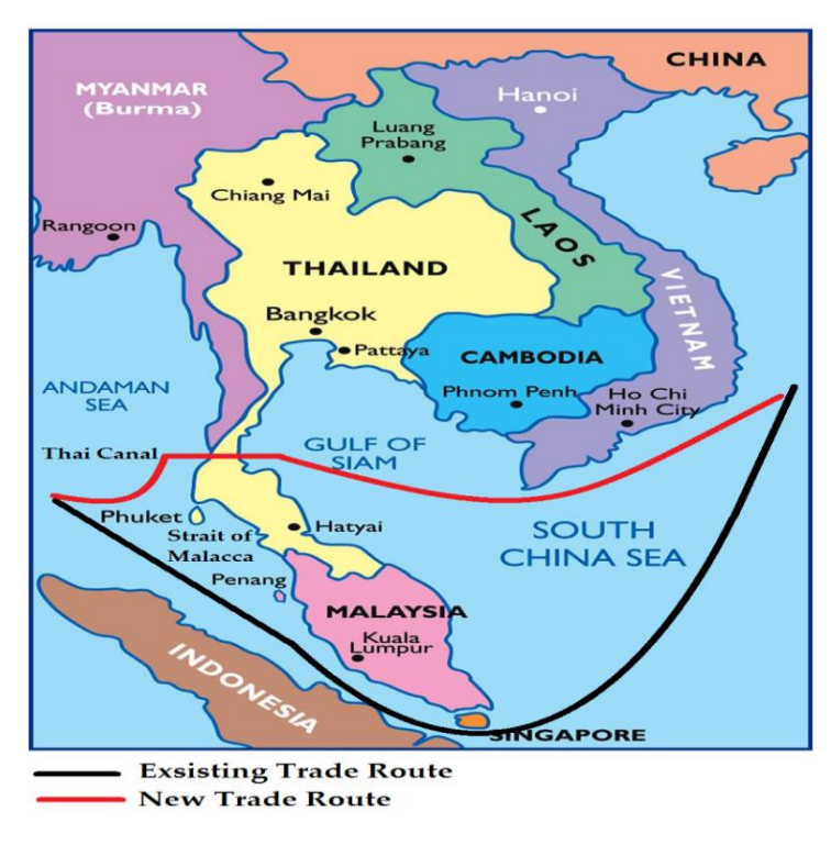
Figure 1: Existing and new trade route to/from east and west