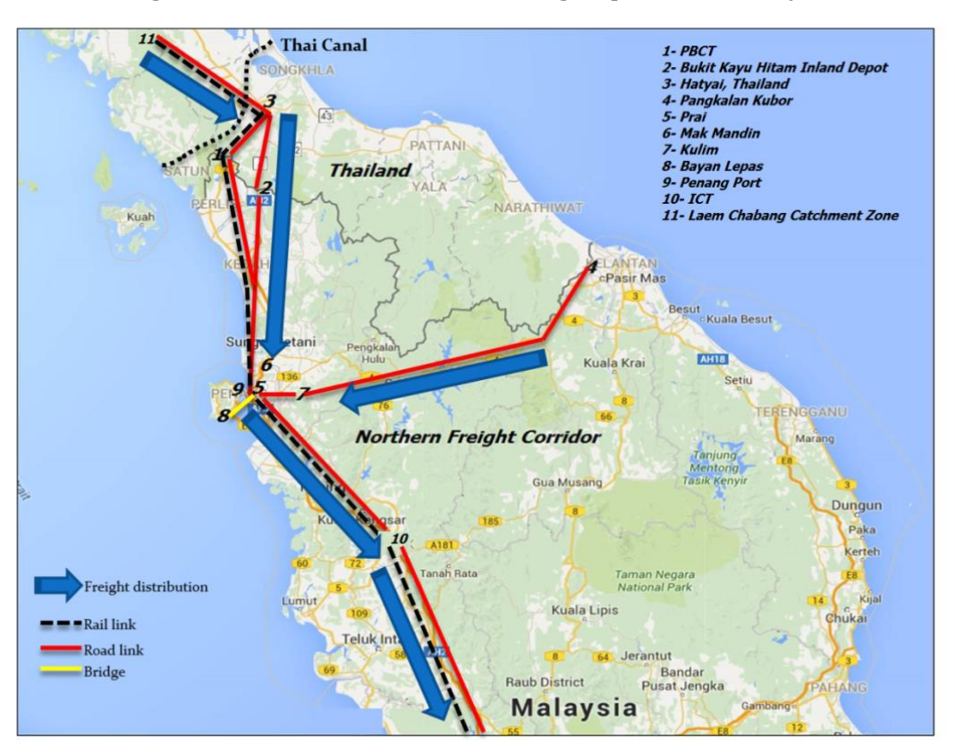
Figure 3: Trade facilities in northern region peninsular Malaysia