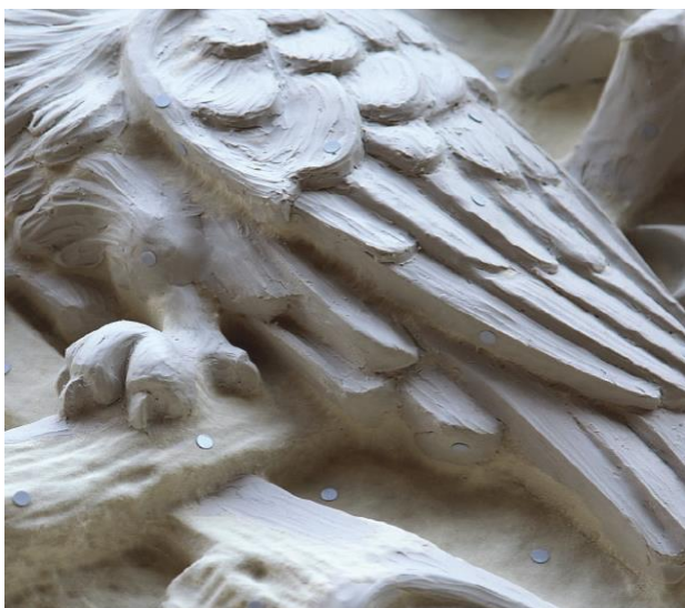
Figure 1. Repaired foam maquette (Hayes et al. 2015)

Hayes et al. 2015, used photogrammetry and handheld scanning to digitize stone decayed sculptural elements on the Canadian parliament buildings. They used the photogrammetric data to fabricate 1:1, as-found maquettes from high density foam with a 3-axis CNC router. Their final model was milled from stone with a 6-axis robotic arm and hand finished by Phil White, the Dominion Sculptor of Canada. They categorize this process as Digitally-Assisted Fabrication; using digital tools to augment the work of the craftsman.