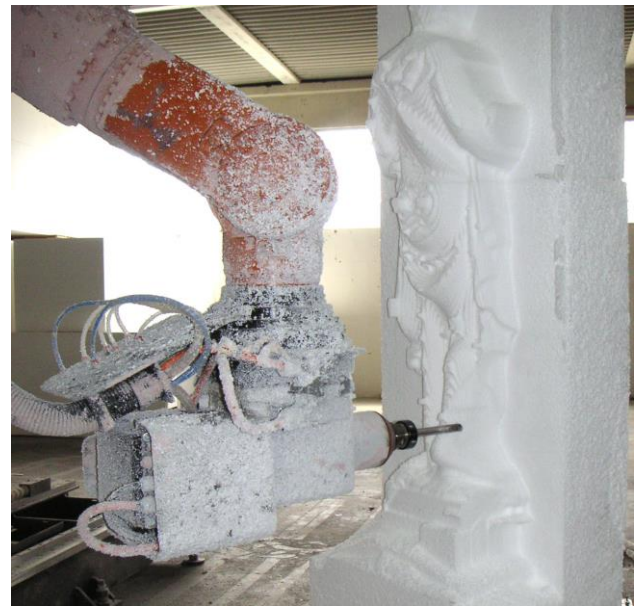
Figure 4. Robotic milling of statue from polystyrene (Tucci and Bonora 2007)

orientation of the hand scanner. They tested milling a replica of the statue from polystyrene and 3D printing the head from ABS.