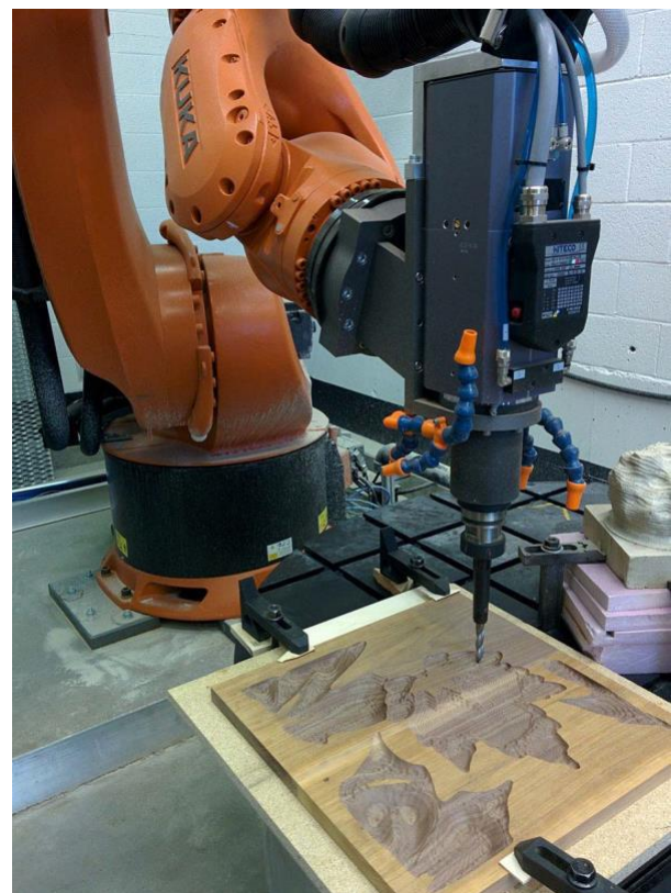
Figure 2. Milling a test piece of walnut using the KR360 (Percy et al. 2017)

Percy et al. 2017, used the Digitally-Assisted Fabrication method, developed in Hayes et al. 2015, to mill a design test for the new Chamber of the Senate of Canada. The project is not directly for heritage, but it is as a result of the rehabilitation of the Centre Block. Phil White, the Dominion Sculptor of Canada, carved ten species of maple leaves in medium density urethane foam. These carved leaves were digitized using photogrammetry and then arranged digitally to create the final composition. A 6-axis robotic arm was used to mill the final composition in wood.