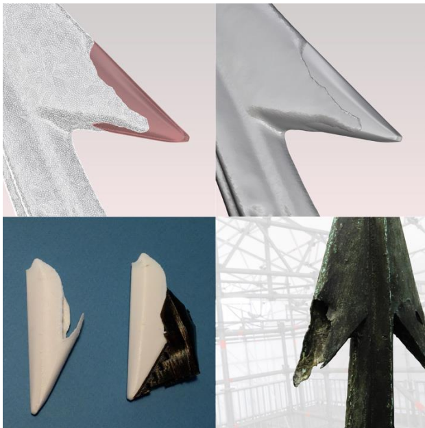
Figure 3. 3D Print repair for sculpture (Apollonio et al. 2017)

Apollonio et al. 2017 leveraged photogrammetry in multiple applications for the restoration of Bologna's Neptune Fountain. They captured accurate and detailed geometric and colour data for surface cleaning analysis, planning new water system and jets, lighting design simulation, structural analysis, visualization/renderings, and 3D printing to repair holes and missing elements. They were able to capture the complex geometry of the sculpture and the damages in order to 3D print new repair elements with a precise fit.