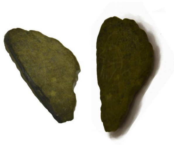
Figure 6. Comparison between the coloured 3D replica and the "augmented" one (Ballarin et al. 2018)

objects more intimately than the originals. They understand the artefacts through more senses than just seeing the original. They also created a version in which the colour texture was used to augment the printed geometry.