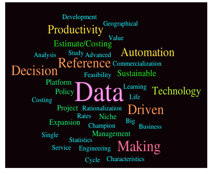
Figure 1 Dominant codes for big data value from QS profession context

Analysis of 'data centralization' code describes the big data as a