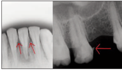
Figure 1. X-ray views of dental calculi (arrows).