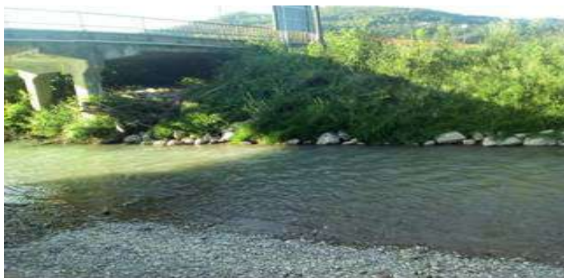
Figure 2. Sampling location after the discharge of wastewaters from the Lučani collector

Ecological and Chemical Status of Surface Waters and Parameters of Chemical and Quantitative Status of Groundwaters (Official Gazette, Issue No. 74/2011).