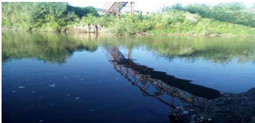
Figure 1. Sampling location before the discharge of wastewaters from the Lučani collector

In accordance with valid regulations, changes in the properties of basic physical and chemical parameters of water required for the classification and determination of water quality were monitored. Testing was conducted in July and October 2015, and January, May and July 2016. Analyses were performed at the Public Health Institute, Čačak and at the Laboratory of the Faculty of Agronomy, Čačak. Physicochemical analyses of major water quality indicators were carried out using standard laboratory methods at the Public Health Institute, Čačak. At the laboratory of the Faculty of Agronomy, volumetric methods of analysis (acid-base titration, precipitation, complexometric titration, oxidation-reduction titration) and gravimetry were used for the quantitative analysis of water. The analyses were performed under the Ordinance on Parameters of