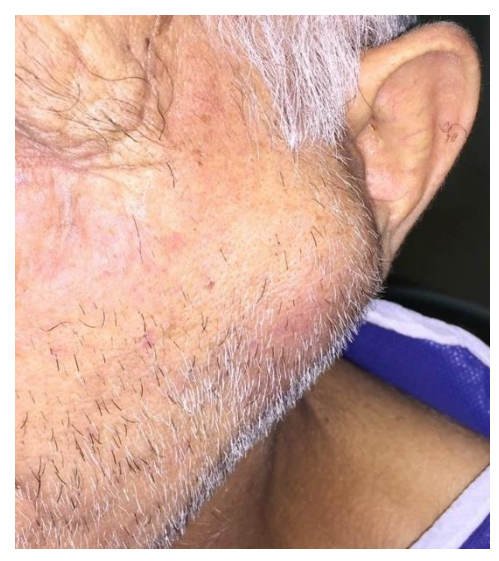
Figure 1. Tumor of the left parotid gland

underwent excision of both parotid gland and limbal tumors with parotidectomy of the left side and excisional biopsy of limbo-conjunctival mass (Figure 3). The systemic evaluation revealed no other site of involvement and metastasis.