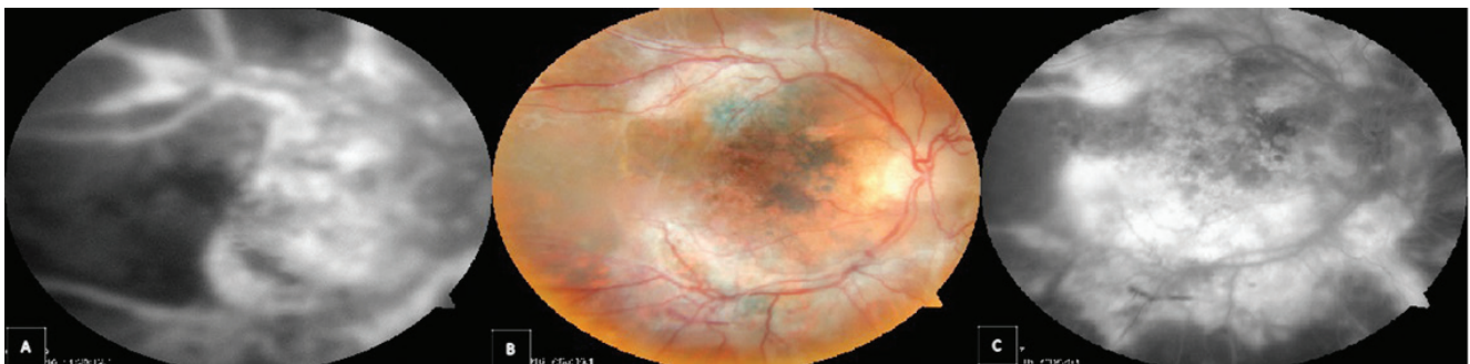
Figure 2. A) At 1 month, hemorrhages were substantially resolved but there was persistent severe vascular leakage and capillary loss in fluorescein angiography despite high-dose anti-inflammatory treatment, B) Fundus photography at 5 months shows neovascular membrane formation, C) Fluorescein angiography shows minimal vascular leakage and extensive retinal infarction