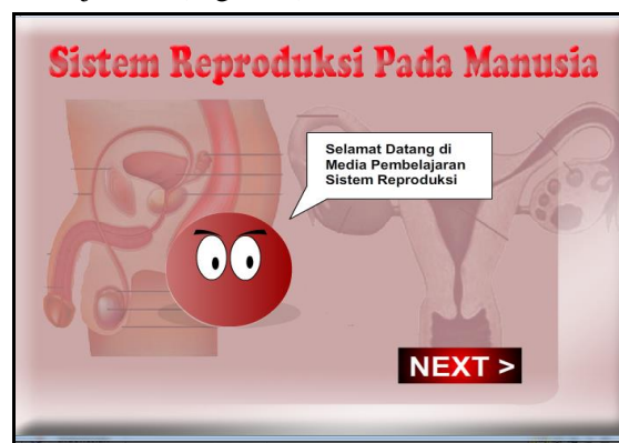
Figure 1. Introduction template. The 'next' button's function is to go the main menu