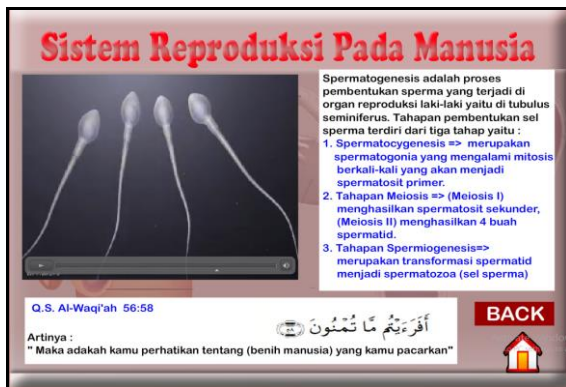
Figure 4. Animation video explains the process of spermatogenesis, oogenesis, and fertilization. The Quran verses related to each concept are inserted in the template.