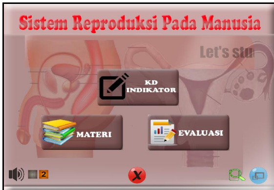
Figure 2. The main menu consists of learning competencies, indicators and materials.

b) The main template consists of learning material (Figure 2-3), video included into Macromedia Flash software frame (Figure 4), and evaluation tests (Figure 5). The Quran verses used are Q.S. Al-Waqi'ah: 58, Q.S. Al-'Alaq: 2, Q.S. An-Najm: 45-46, Q.S. Al-Qiyaamah: 37-39, Q.S. Al-Mursalat: 20-21, Q.S. At-Tariq: 6-7, Q.S. As-Sajdah: 7-9, Q.S. Al-'Infitaar: 7-8, and Q.S. Al-Mu'minuun: 67.