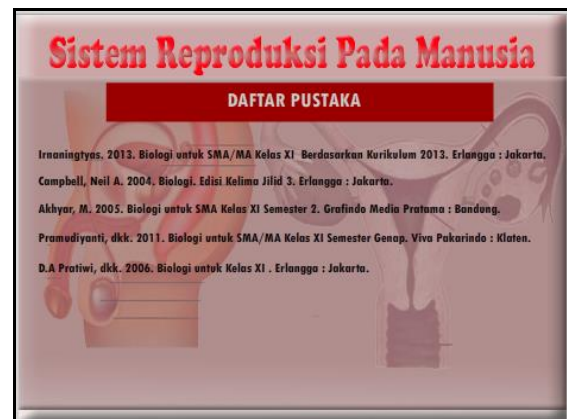
Figure 6. The template of references list.

c) The closing template contains of references (Figure 6). References list can be used to help students to find and access other learning source.