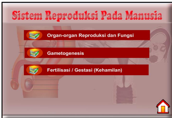
Figure 3. The materials template. Each topics has detailed explanation.