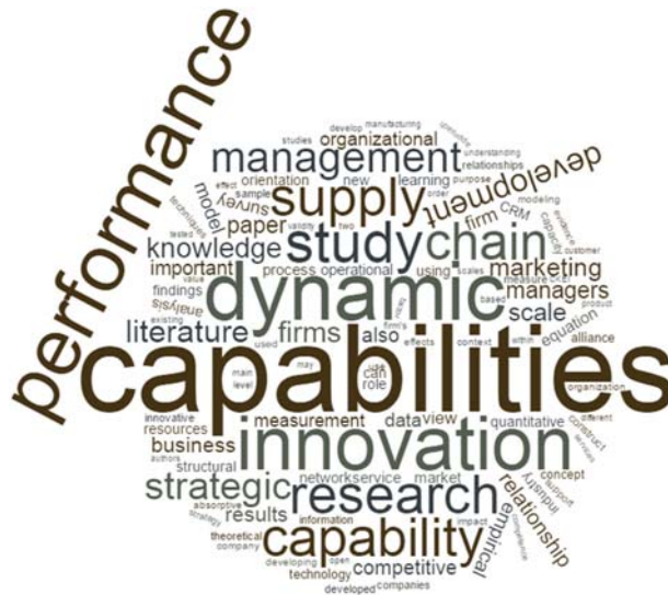
Figure 3. Wordcloud designed based on the abstract of the 42 selected articles

Note: To design the Wordcloud, we used the website www.wordclouds.com/