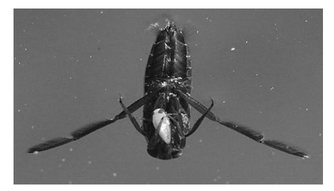
Photograph of backswimmer in water

The mandibular plate is well separated from the maxillary plate by a transverse suture. The basal margin of the mandibular plate possesses a mush elongate, subtriangular lever which is connected with the mandibular style. The mandibular stylets (MNST) are a pair of needle-like structures found and on each side. Each stylet is thick at its base and is provided with a flat triangular plate-like a lever. Each mandibular stylet (MNST) is rectangularly curved at its base behind the basal margin of the lever for the attachment of the muscles. The tips of the mandibular stylets resemble cart screw and are acutely pointed.