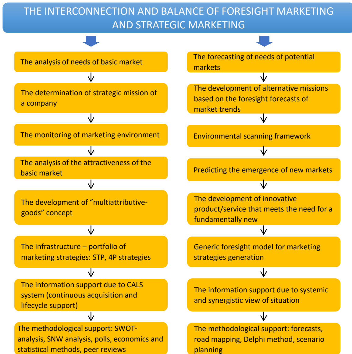
Figure 2. The interconnection and balance of foresight marketing and strategic marketing

Management of strategic marketing in the company involves the formation of a controlled external environment through the development of relationships with partners and designing a network context, the development of the company that allows to increase the strategic potential and to provide a competitive advantage. Thus, it is clear that, to ensure a dynamic strategic vision as the basic concept of foresight marketing, marketing thinking based on foresight is impossible to imagine without the active support of strategic marketing, the interconnection and the balance of which is schematically shown in Figure 2.