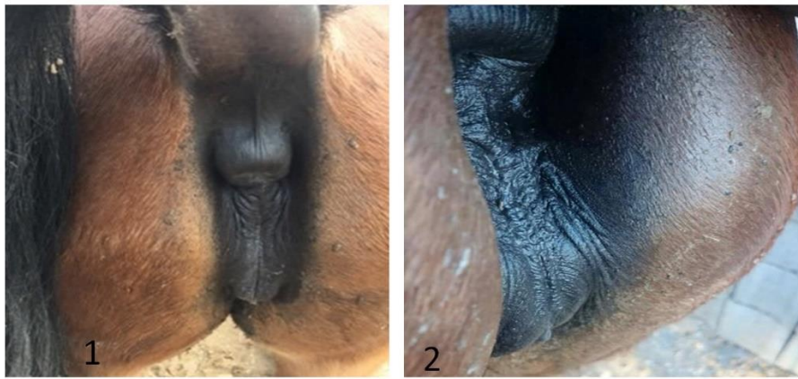
Figure.1: Reveals grade I caslick's index with good vulvar conformation Figure. 2: Reveals grade II caslick's index with moderate pneumovagina