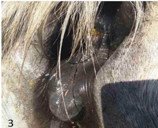
Figure. 3: Reveals grade III caslick's index with poor vulvar conformation