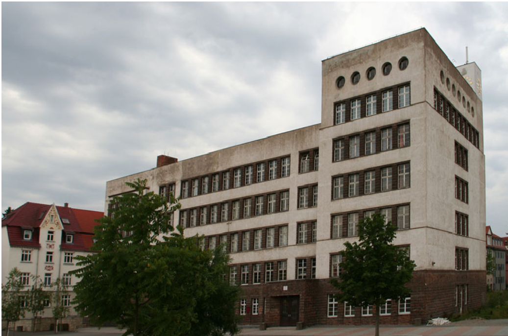
Figure 1. Friedrich Schiller Gymnasium in Weimar 2

Until today, citizenship education in Germany has been debating the students’ involvement, the developing project’s dynamic – “from a single action to a broad campaign” – and its impact on the understanding of democracy of children and adolescents. Five documentations of this project have been published so far (Lokies 1997; Beutel, Lokies 1999 a, Beutel, Lokies 1999 b; Beutel, Lokies 2001 as well as online in the project data base of the contest Acting Democratically “Demokratisch Handeln” 3 ). Four commentaries discuss the case critically from the perspective of subject-didactics and the education for democratic citizenship – “Demokratiepädagogik” (Breit 2005 a; Breit 2005 b; Grammes 2010; Petrik 2010).