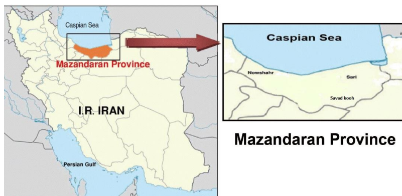
Fig. 1: Map of Mazandaran Province, northern Iran and 3 different cities (Sari, Savadkuh, and Behshahr), Iran

This study was conducted in the suburbs of 3 different cities (Sari, Savadkuh, and Behshahr) in the Mazandaran Province, Iran. The Mazandaran province (36° 33' 56" N 53° 03' 32" E) is located in northern Iran on the southern coast of the Caspian Sea (Fig. 1). It covers an area of approximately 23842 km 2 and has a population of 2,922,432 individuals. This province has a moderate and subtropical climate and is geographically divided into the three regions: plains, forests, and mountains.