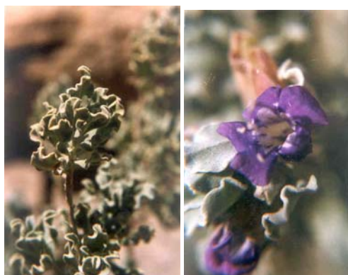
Fig. 2 Flower and leaf of Zhumeria majdae Rech. f. & Wendelbo