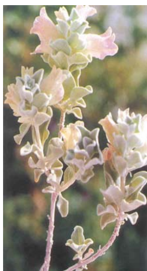
Fig. 3 Trimming of Zhumeria majdae Rech. f. & Wendelbo

Z. majdae is commonly used in traditional medicine and its therapeutic properties have long been considered. The natives boiled the leaves to treat