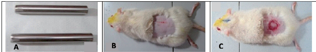
FIGURE 1. A: skin puncher; B: prepared and draped female rat; C: initial wound

separate cages in the Integrated Research and Testing Laboratory (LPPT), Universitas Gadjah Mada, Yogyakarta. Rats were given anesthesia using an intramuscular dose of ketamine 30 mg/kg of body weight. Following after anesthesia, the hairs on the back were shaved after they were cleaned by using 10% povidone-iodine. The wound was created in the back area that was free of hair with a diameter of approximately two centimeters in full thickness (FIGURE 1).