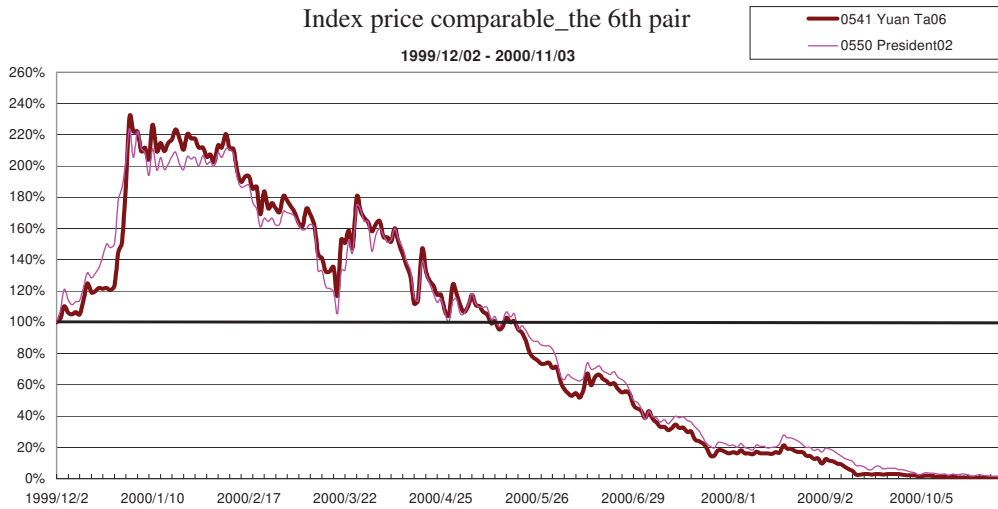
Fig. 2. Comparable plots of warrant index prices by 6 th pair

the GARCH(1,1)-M model for the sample warrants. Compared the estimates of variance in conditional mean for all sample pairs, the reputable investment banks in the 2 nd and 3 rd pairs had less variance than less reputable investment banks. However, in the 1 st , 4 th , 5 th and 6 th pairs, less reputable investment banks had less variance than reputable banks. The result cannot support our assumption that the warrant issued by reputable investment banks has less volatility than that issued by less reputable investment banks.