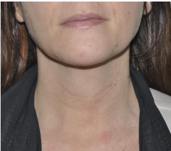
Fig. 3. Cosmetic outcome of a transoral thyroidectomy

Considering the economic reality of most countries, the alternative use of TT seems to be a more feasible option. TT can be carried with or without the aid of the robot, with only the use of conventional endoscopic instruments. In conclusion, this is an opinion report of our ongoing experience on TT. We will continue to carefully apply this technique in selected patients (Fig.3). TT should only be performed in highly specialized centers for endocrine and endoscopic surgery. Current and future trends in research will focus on refinement or developing dedicated surgical instruments.