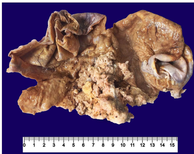
Figure 1. Gross appearance of the specimen after fixation and sampling. Note that most of the internal surface is lined by a smooth surface and in the center of the picture an excrecent and irregular lesion arises, which represents the sebaceous carcinoma.

The transformation of a mature cystic teratoma happens when one or more of its components