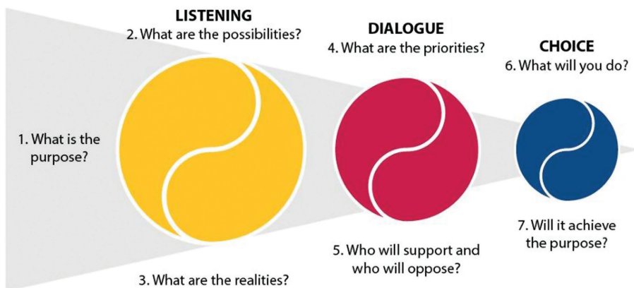
Figure 2: Three phases of the CORE approach.

Guidance on the CORE approach (Ratner and Smith 2014), as well as a suite of tools for use in assessment, planning, monitoring, and evaluation (Rüttinger et al. 2014), were developed in advance of initiating the multistakeholder dialogue processes in each case study site, then adapted on the basis of learning from these cases. The following summaries give an overview of how the process was adapted to each local setting.