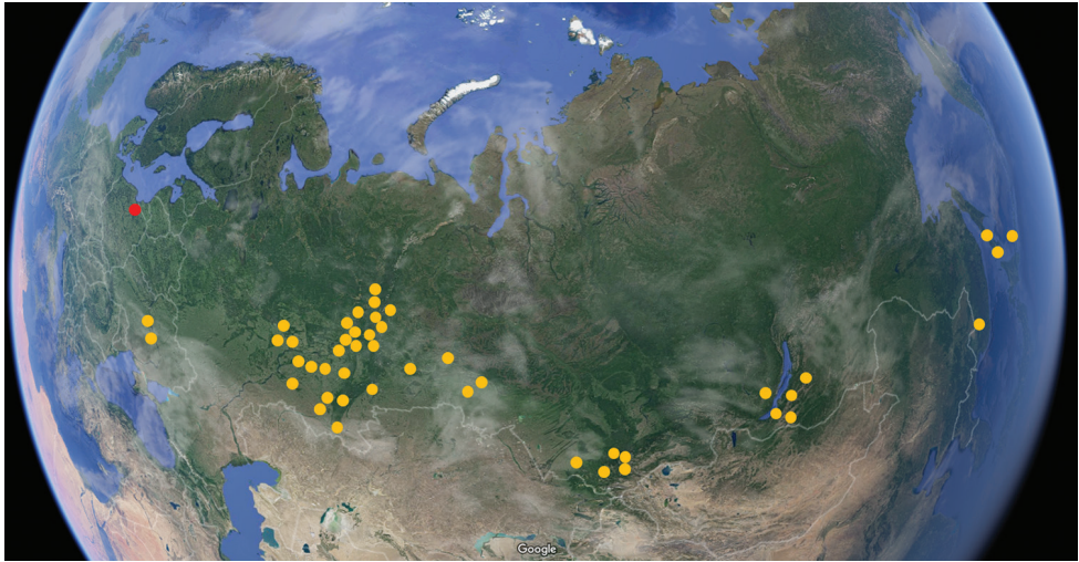
Figure 9. Distribution map of Lithobius proximus Sselivanoff, 1878 based on a summarisation of the published data (yellow dots; Zalesskaja 1978, Zalesskaja and Golovatch 1996, Chornyi and Kosyanenko 2003, Farzalieva and Esyunin 2008, Kosyanenko and Chornyi 2008, Kunakh 2013, Sergeeva 2013, Nefediev et al. 2017a, b, Nefediev et al. 2018) and our records (red dot; this paper).