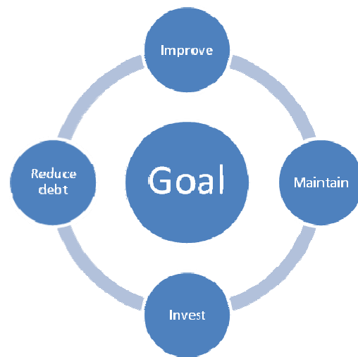
Fig. 1. Elements for production strategies

performance in a very competitive market (Investor reports, 2012).