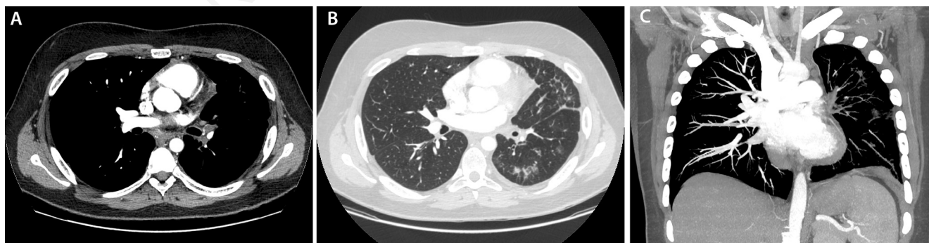
Figure 1. A) MDCT angiography showed almost complete hypodensity of left pulmonary veins with severe stenosis of both veins. Regular opacification of right interlobar artery and upper right pulmonary vein. B) MDCT angiography (lung window): multiple nodular lesions, GGO areas and linear parenchymal band in lingula and lower lobes. Interstitial septal thickening is prominent and also evident in subpleural region of lingula. These CT finding in absence of sign or symptoms of infectious disease are suggestive of pulmonary venous infarction related to venous stenosis. C) MDCT angiography, maximum intensity projection (MIP) 25 mm of thickness, coronal view: superb evaluation of lack of enhancement of pulmonary veins system to left. Regular opacification of pulmonary artery and veins to right.

In pediatric or adolescent subjects, AF is relatively rare, in the absence of either structural or functional heart disease, and in the absence of any identifiable hormonal or chemical cause. Although initial management should be conservative, in some cases during adolescence, the arrhythmia typically recurs multiple times despite medical therapy, creating a need for ablation therapy similar to the scenario in adults. The use of catheter ablation as been reported for paroxysmal supraventricular tachycardia and atrial fibrillation in young patients [7-8].