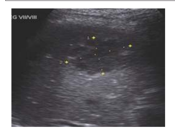
Fig. 1a: USG Abdomen