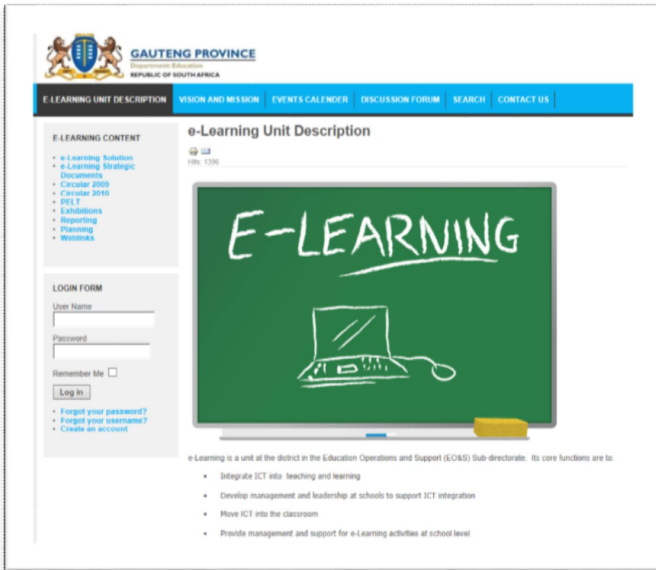
Figure-2: e-Learning CMS

This study made a conscious and informed decision to use the ISSM model to evaluate the quality of information in the e-Learning CMS. Figure 2 depicts the e-Learning CMS designed by the researcher and used in this research.