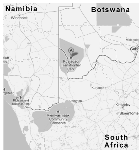
Map 1: Kgalagadi Transfrontier Park

Merwe, 2004). Hence, competition is increasing and understanding tourist's reasons for visiting becomes more important in developing successful nature-based products.