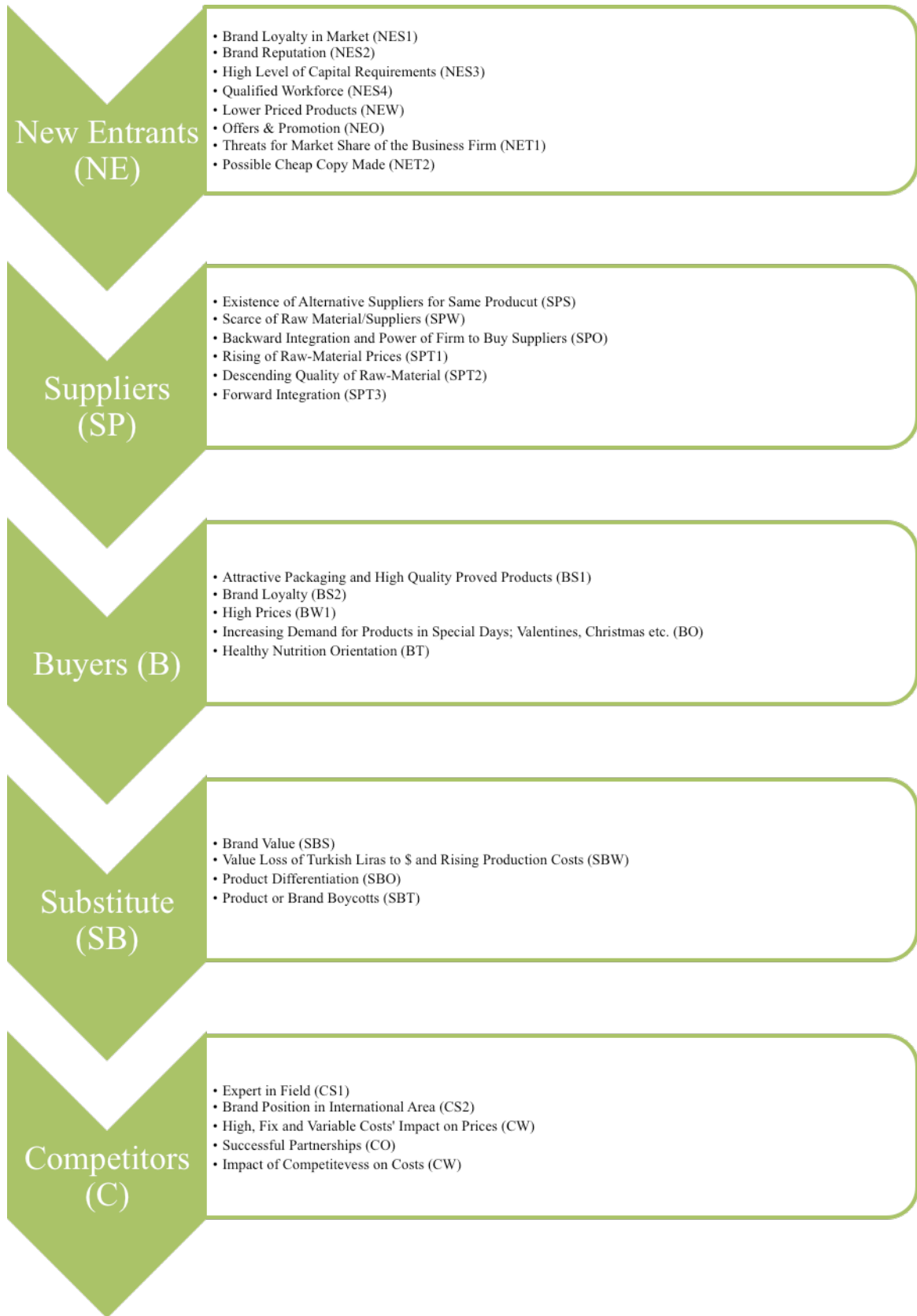
Figure 1. SWOT Analysis Based on Porter's Five Forces Model