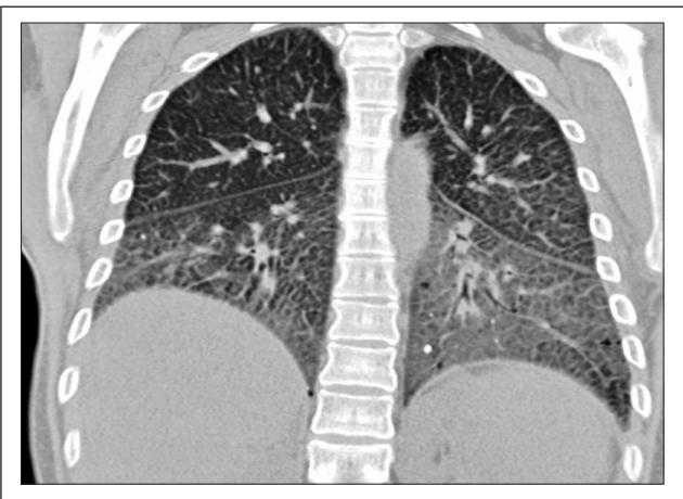
Fig. 4. - "Crazy paving" pattern created by the intermixing of ground glass opacities and thickened interlobular septa; several millimetric calcific nodules and a hazy, centrilobular non calcific nodule are also appreciable.

the six minutes walking test in the patients affected by NPDB [5, 28]. Unlike what happens in most of the interstitial lung diseases (ILDs), especially in idiopathic pulmonary fibrosis, characterized by a predictable correlation between radiographic abnormalities and functional impairment throughout the whole duration of the disease, in the early stages of NPDB there is a typical, remarkable "disassociation" between radiographic and functional findings due to the histopathological substrate of septal thickening: although interstitial infiltration by the lipid-laden histiocytes causes the appearance of CXR and HRCT patterns similar to those observed in fibrosing ILDs, there is no ultrastructural remodelling of the "only congested" alveolar-capillary membrane, almost entirely lacking fibrosis and other signs of chronic involvement, with DLCO values amazingly unchanged even in the presence of marked radiographic signs [5, 14, 20]. It is also possible, however, to observe absent or mild radiographic abnormalities in association with a severe respiratory failure, resulting in the need to integrate the results of functional tests and radiographic exams in order to achieve a proper balance of the disease [13]. Another factor not to be overlooked in the occurrence of respiratory failure in patients with NPDB, probably also significant in the case we described, is hepatosplenomegaly, sometimes marked so as to interfere with diaphragmatic activity [13].