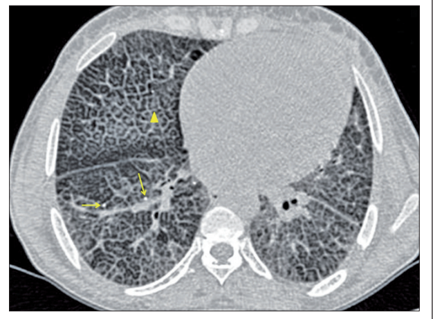
Fig. 3. - Progression of lung injury in NPDB. Septal thickening and "ground glass" opacities are initially prevalent at lung bases, then cranially progressing up to cover the whole lungs.