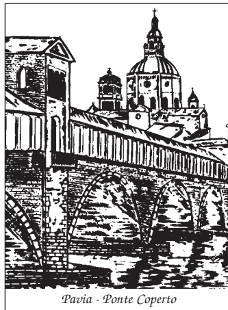
Pavia - Ponte Coperto