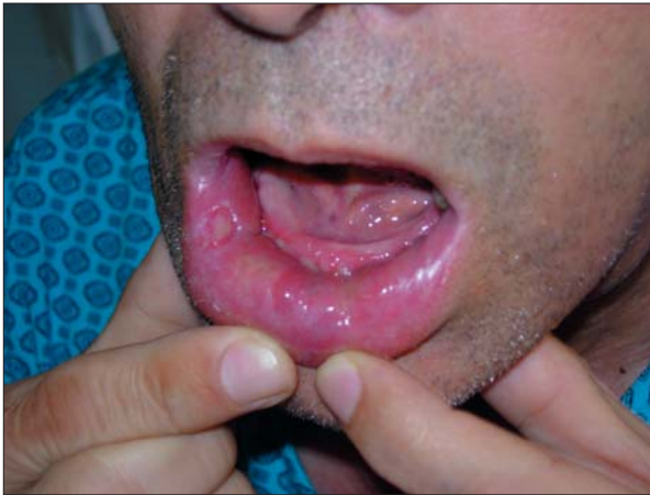
Fig. 1. - Protuberant and painful lesion on the lower lip.

mental 3x3 cm, right submental 3x2 cm and 2x2 cm, right supraclavicular 1x1 cm. With the exception of inspiratory rales, respiratory and other system physical examinations were normal.