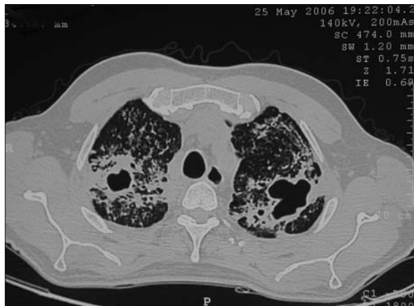
Fig. 2. - Bilateral cavity and reticulonodular density on thorax CT.

A tuberculin test was measured 22 mm/72 hours. There were increased erythrocyte in urine microscopy. Urine AFB was negative in direct mi-