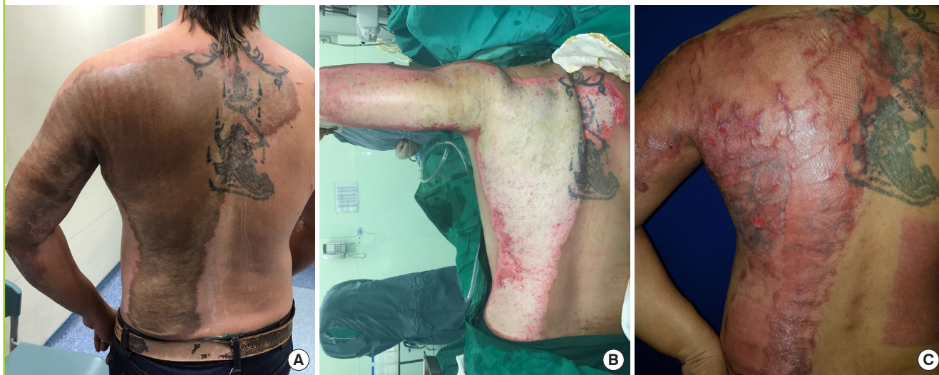
Table 1. Characteristics of the patient population

Patient 4 sustained a 13% total body surface area burn after exposure to sulfuric acid. (A) A dark brown eschar formed after exposure to the acid, clearly demarcating healthy and unhealthy skin. (B) After debriding the eschar, the true depth of the burn could be evaluated. As this was a deep dermal burn, it required further debridement and secondary skin grafting. (C) After 1 month, the patient had recovered well and returned to employment.