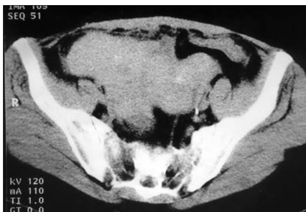
Fig. 2. - Computed tomography of lower pelvis: the arrow indicates an extensive endometriotic tissue.

implantation of ectopic endometriotic tissue in all cases of endometriosis [5]. There is evidence that immune system alteration either inherited or acquired plays a role in the onset and development of endometriosis [6] induce ectopic implantation of endometrial cells in peritoneal cavity by way of retrograde menstruation. According to this concept, endometrial cells, shed during the menstrual period are displaced physiologically into the peritoneal cavity in all women. In healthy women, they are disposed of by the local immune system. Endometriosis may develop when a defective peritoneal immunity leads to reduced disposal and/or increased angiogenesis. Whether the immunological factor is a separate cause or a synergistic factor to one or more other cause is yet to be established. Pulmonary endometriosis is classified as either pleural or parenchymal. Hemothorax is more frequently associated with pleural endometriosis. The mechanisms underlying pleural and pulmonary endometriosis is poorly understood and probably differ. There is embryological evidence that celomic membrane covers both the abdominal and thoracic cavities, so endometriosis may develop outside the pelvis through celomic metaplasia [7]. On the other hand, extragenital endometriosis is a rare condition therefore pleural deposits may be the result of a transdiaphragmatic spreading of pelvic endometriosis, whereas embolism is a possible explanation for the parenchymal lesion [2]. The main