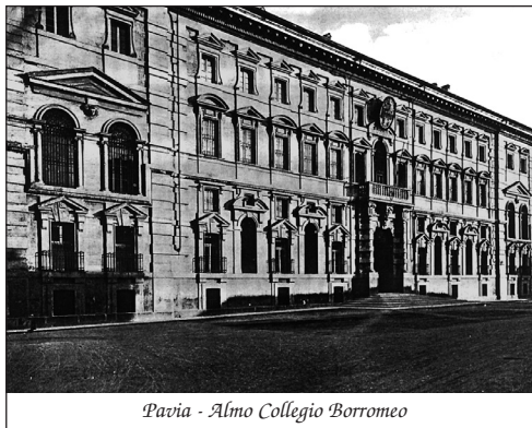
Pavia - Almo Collegio Borromeo