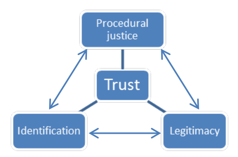
FIGURE 2: THE DRIVERS OF TRUST