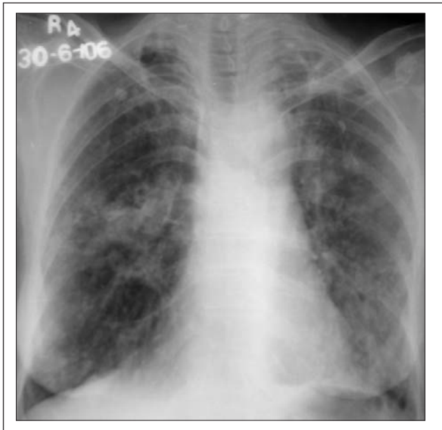
Fig. 1. - Chest radiograph showed linear opacities suggesting fibrotic bands in both the upper lobes and lower zones (tenting of diaphragm) while the right middle zone shows areas of non-homogenous alveolar opacities. Both the mid-zones also show numerous cystic spaces.

The post-bronchodilator values of FEV_1 and FVC were 1.06 litres and 1.67 liters. Subsequently a work up for ABPA was carried out. Skin test for Aspergillus fumigatus (type 1 and type 3 hypersensitivity reactions) was positive. Serum precipitating antibodies against A fumigatus were present. The absolute eosinophil count was 1120/µL, serum total IgE levels were 2200 IU/ml and specific IgE against A fumigatus was 17.7 kUA/L (normal, less than 0.35 kUA/L). A diagnosis of ABPA was thus made and patient initiated on oral prednisolone 0.75 milligram/kilogram body weight every day. The patient also received oral sustained-release theophylline at a dose of 450 mg/day. On follow up after 6 weeks, she had significant improvement in her symptoms along with a reduction in IgE levels to less than 50% of baseline levels. Prednisolone was continued for a total duration of eight months and then terminated.