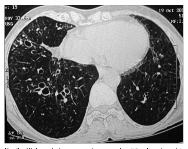
Fig. 3. - High-resolution computed tomography of the chest shows bilateral areas of bronchiectasis. In addition centrilobular nodules with tree-in-bud is also seen in the right lower lobe.

report [2]. The index patient was evaluated for ABPA in view of the history of expectoration of blackish brown mucus plugs - a symptom that occurs in nearly half of patients with ABPA [7]. It could also be debated whether the fibrosis and volume loss seen in left upper lobe were due to ABPA per se rather than as a sequelae of healed PTB. However, the fact that the patient had documented sputum positive pulmonary tuberculosis and the temporal profile of the patient suggests otherwise. It would also be distinctly unusual for a patient with active ABPA to have disease remission with anti-tubercular therapy alone and have the disease quiescent for almost 40 years without any therapy.