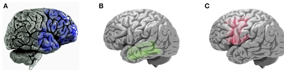
FIGURE 1 | Patterns of brain atrophy in clinical subtypes of frontotemporal dementia (7–9). (A) Areas of brain atrophy in behavioral-variant frontotemporal dementia (blue), right hemisphere lateral view; (B) Areas of brain atrophy in semantic-variant primary progressive aphasia (green), left hemisphere lateral view; (C) Areas of brain atrophy in non-fluent variant primary progressive aphasia, left hemisphere lateral view.