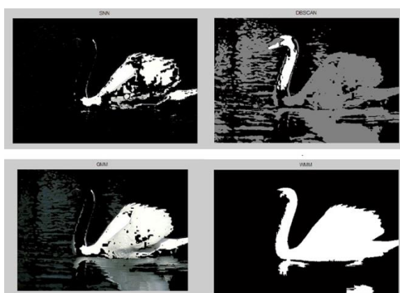
Figure 3. Segmentation results obtained from SNN (Left-top), DBSCAN (Right-top), GMM (Left-down), and WMM (Right-down).

Figure 3 shows the segmented areas (clusters) for the image #8068 in the dataset by the implemented clustering methods.