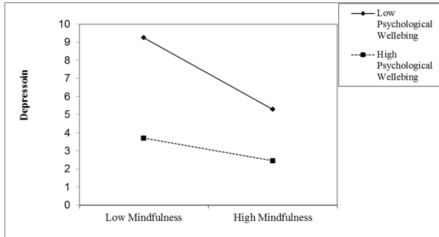
Figure 2. Moderating role of psychological wellbeing between mindfulness and depression.

This moderation might provide clues for the moderated mediation since the relationship between mindfulness and depression constituted part of the indirect path from external locus of control and depression. This moderated mediation was further investigated by computing the conditional indirect relationship of external locus of control with depression through mindfulness at various levels of psychological wellbeing through PROCESS macro for SPSS (Hayes, 2013). The results are presented in table 4.