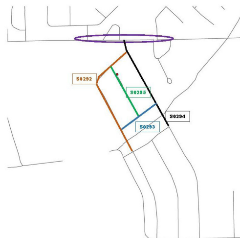
Figure 3. Example of a man-made barrier neighborhood included in the Delta Neighborhood Physical Activity Study. This map illustrates the street segments of a neighborhood bounded by a busy street that inhibits walking due to its uncontrolled intersection and lack of sidewalks. The red circle depicts a Delta Healthy Sprouts participant's residence, the colored lines with identifying numbers depict the neighborhood street segments that were measured, and the purple ellipse depicts the busy street that functions as a barrier.