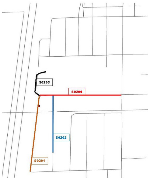
Figure 1. Example of a standard neighborhood included in the Delta Neighborhood Physical Activity Study. This map illustrates the street segments of a neighborhood located in primarily residential section of town. The red circle depicts a Delta Healthy Sprouts participant's residence and the colored lines with identifying numbers depict the neighborhood street segments that were measured.

(9%) followed by restaurants/café (3%). Percentages of walkability items in good or excellent condition ranged from 85% for roads to 100% for signage, traffic lights, speed bumps, and public lighting (data not shown). Similarly, for the majority of residential, public/civic, and commercial structures, 100% of them were in good or excellent condition with the following exceptions – residential: mobile homes (89%), single family detached homes (90%), and multi-family homes/apartments (92%); public: playgrounds (96%) and churches/other religious buildings (99%); commercial: convenience stores (91%) and other commercial buildings (94%) (data not shown). All elementary and middle/junior high and 90% of high schools were in good or excellent condition (data not