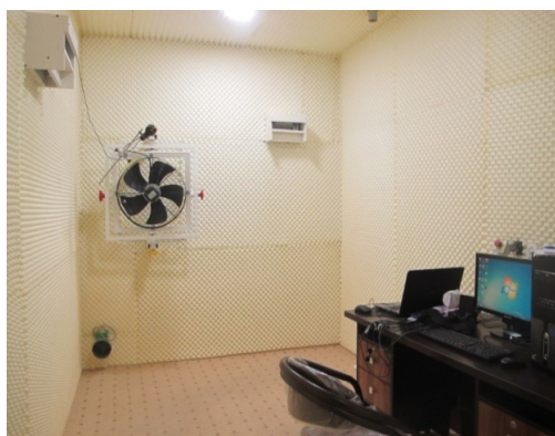
Figure 1. Experimental setup in Air conditioning chamber.

work with the N-back software. 28 All of the people were working while sitting and the order of doing the job was from low to high workload. The participants in this study were required to wear ordinary clothes such as shirts, pants, underwear, socks and shoes. The air temperature was also under controlled conditions (in different stages of the experiment) with the constant relative humidity of 50% in all conditions and the air flow rate of 0.15 m/s. Each task lasted for 5 minutes and each stimulus was displayed for 2500 ms. There were 120 stimuli at all levels of task executed during exposure to different air temperatures (Figure 2).