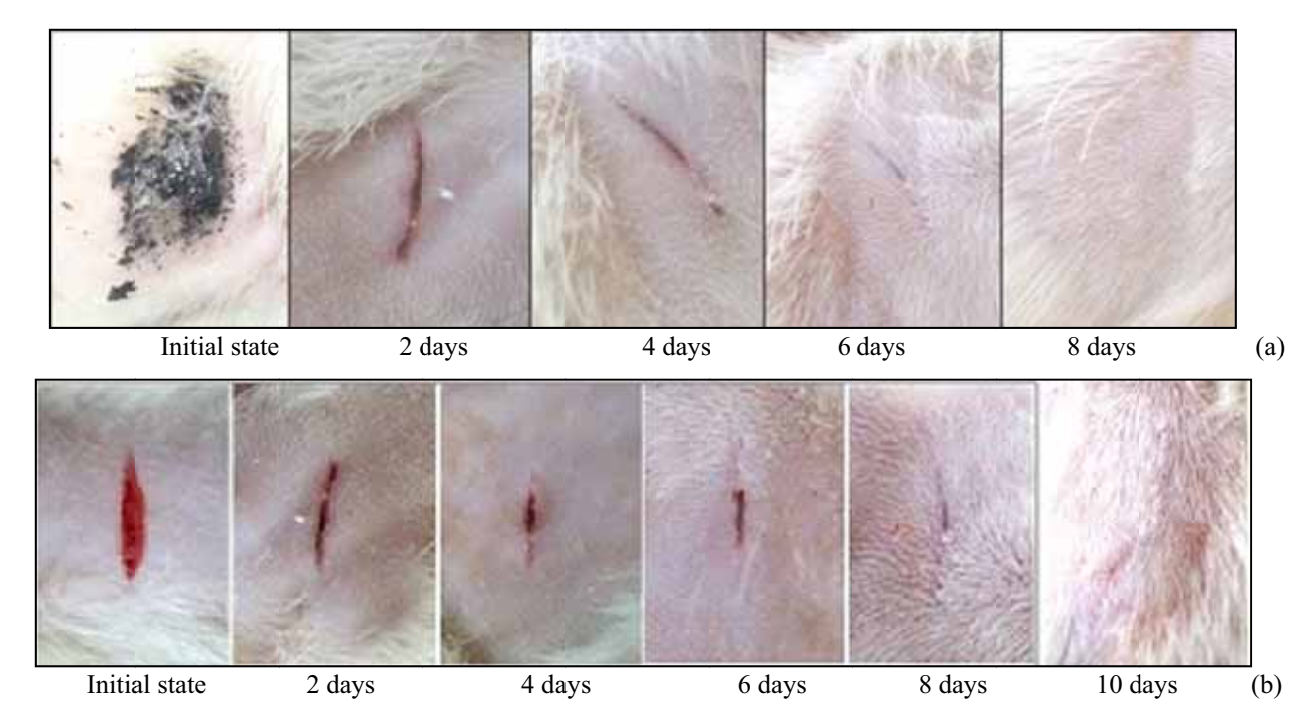
Fig. 2. Dynamics of wound healing treated with (a) suspension form of CRS in lanolin oil and (b) with lanolin oil alone

was healed in 6 days (fig. 2, a) while healing of the wound treated with lanolin oil is observed only in 9 days (fig. 2, b). In Fig. 2 it is visible that the effect of suspension form of CRS reduces wound healing for three days in comparison to control (lanolin oil). Speed of wound defect healing at use of CRS in lanolin oil was registered both on volume, and on the area of wound surfaces.