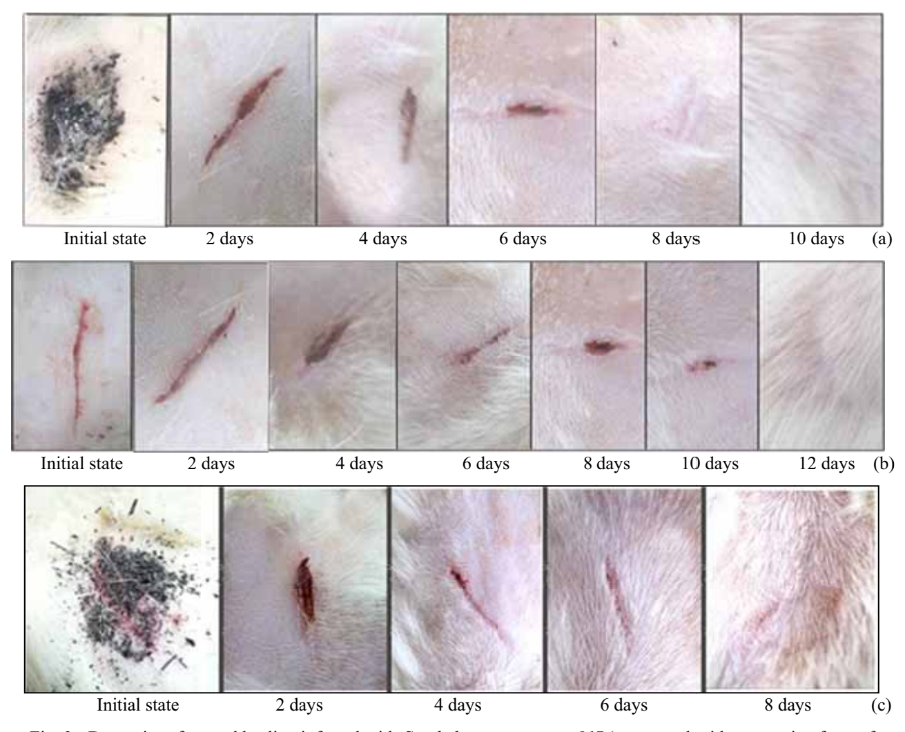
Fig. 3 - Dynamics of wound healing infected with Staphylococcus aureus 817 (a – treated with suspension form of CRS, b – control (untreated), c – treated with powdered form of CRS)

817 to make a purulent detritus. After 24 hours, the right-hand wound was treated with the preparation of CRS suspended in lanolin oil, left side wound was untreated and served as a control. Purulent wound surface of other group of rats was treated with powdered CRS.