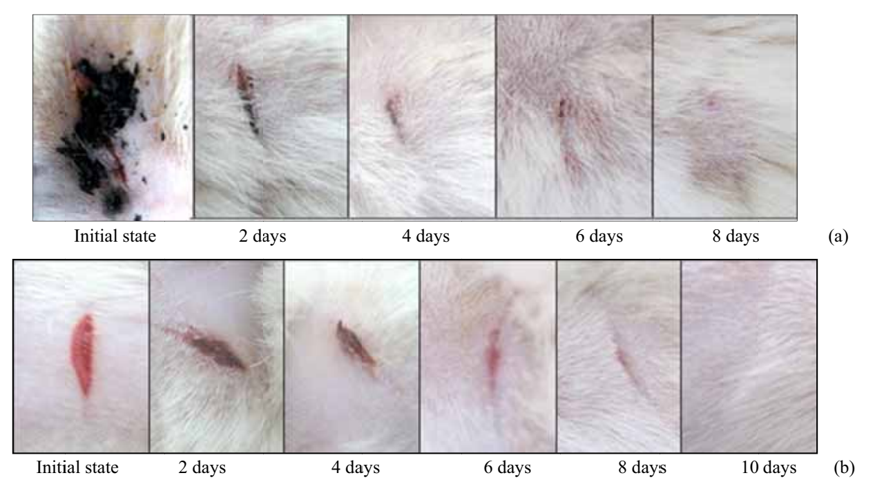
Fig. 1. Dynamics of wound healing; (a) treated with powder of CRS and (b) control

Thus, application of powder of CRS on a wound surface lead to reduction of quantity of wound exudate and the reduction of tissue edema around wounds.